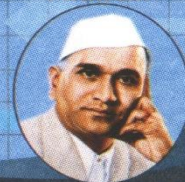
Karmaveer Bhausaheb Hiray